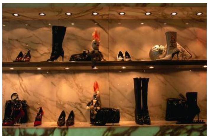
Must buy some Italian shoes