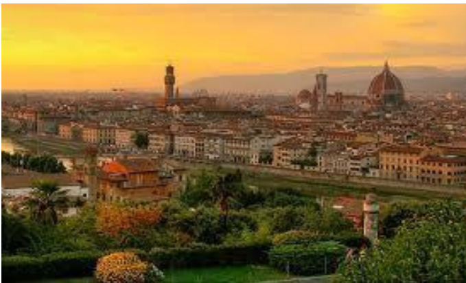
Aerial view of Florence

This afternoon has been kept open to allow those who want to make the short journey into Florence and experience the city at sunset and then enjoy a meal in the ambience of this Renaissance city.