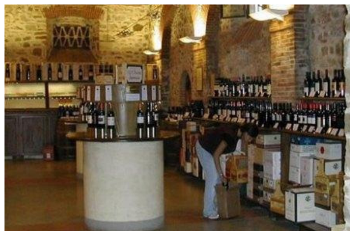
Medieval cellars with choice of Chianti