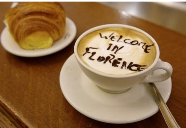
Cappuccino like no-where else

While the golfers are out on the course, the non-golfers take a 25 minute train journey for a guided tour of Florence...the beautiful capital of the Renaissance. The sights and attractions in Florence are endless...including some of the finest art collections in the world including Michelangelo, da Vinci, Titian, Botticelli and Rembrandt. And that is before the shopping begins. There is simply too much to do and see in Florence in a day, so we have allowed free time later in the tour to visit Florence again to revisit or explore further.