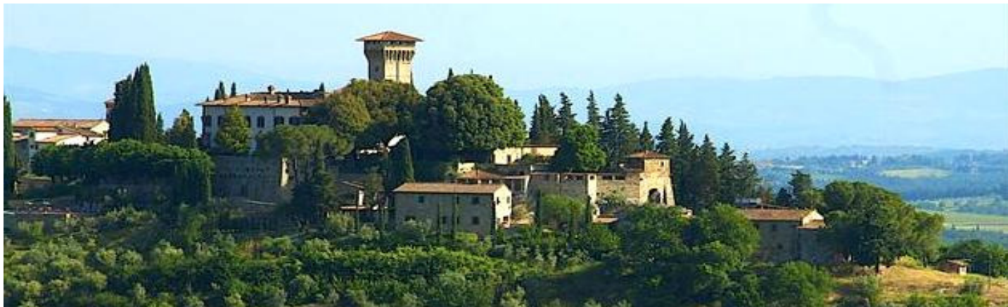
Hilltop winery in Chianti

Today is an early start as we head to Chianti , the famous wine region of Tuscany. Lying South of Florence, Chianti offers a landscape straight out of a Renaissance painting...steeply rolling hills terraced with vineyards and olive groves, bustling market towns and hilltop castles. We visit the small medieval villages with stone houses, red shutters and geraniums and sunflowers before stopping for a wine-tasting in an ancient castle and visiting ancient cellars where the proud produce of Chianti lies patiently maturing.