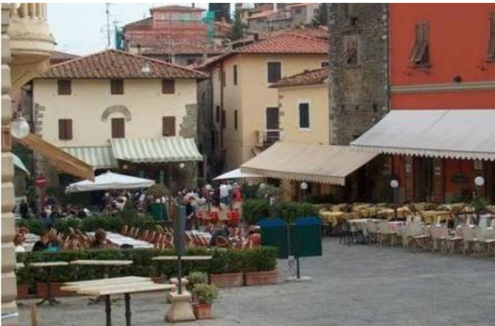
Cappuccino on the Piazza

The nearby town of Pistoia is renowned for its street markets and its picturesque market square and will give the non-golfers one last chance to experience and enjoy the Italian experience.