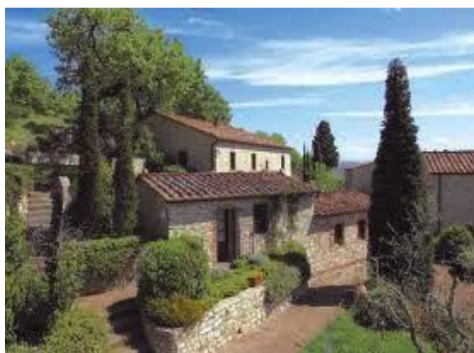
Wine, olives and scenery