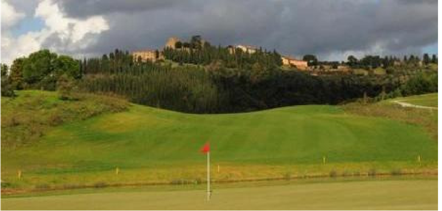
Putting beneath the hilltop castle

Golf today is at the beautiful Castelfalfi Golf Club , Tuscany's only 27 hole club. The recent upgrade incorporated the beautiful landscape with modern standards to create a truly memorable golfing experience.