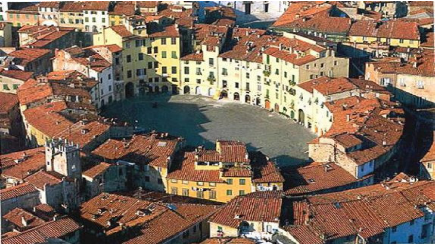
The central Piazza of Lucca

After a chance to explore the sights and the souvenir stalls of PISA, we head for LUCCA , a beautiful historic town where the town centre is entirely enclosed by the old city walls...the only such walls in Italy still accessible. The views from the walls of the surrounding countryside are breath-catching. Lucca exudes a unique atmosphere...modern blending with the ancient and the narrow streets lined with little shops and restaurants are an insight into the history of Tuscany.