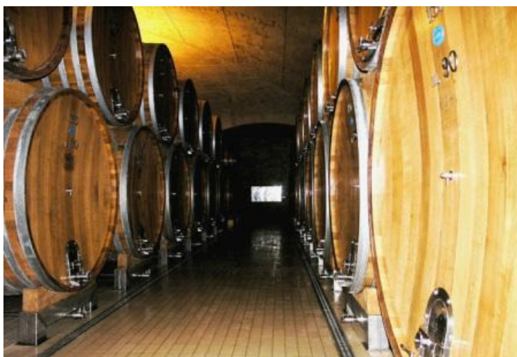
Cellar visit and tasting