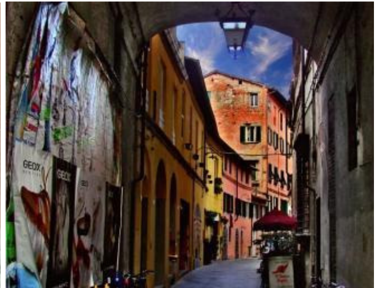
The colours of Tuscany