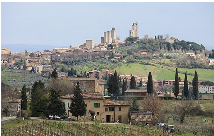
The famous towers of San Gimignano

On the way home this afternoon, we stop at the pedestrianized hilltop town of San Gimignano ...with its 14 remaining towers spiking the skyline. Its medieval treasures have been so well maintained the town was awarded World Heritage Site status. The interior of the Collegiate is swathed in frescoes that must be seen and the climb up the Torre Grossa tower gives you the most stupendous views across the terracotta roofs to the rolling hills all around.