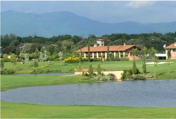
Palmer's pride in Tuscany...La Pavoniere

Golf today is at Arnold Palmer's Tour-quality championship layout La Pavoniere . In the shadow of the Tuscan hills, the course is relatively open with several small lakes adding to the challenge of the natural terrain. Tuscan-style brick walls and bridges add to the ambience and the day's golfing experience will be remembered for a long time!