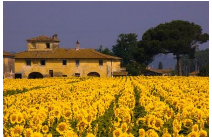
Endless countryside beauty