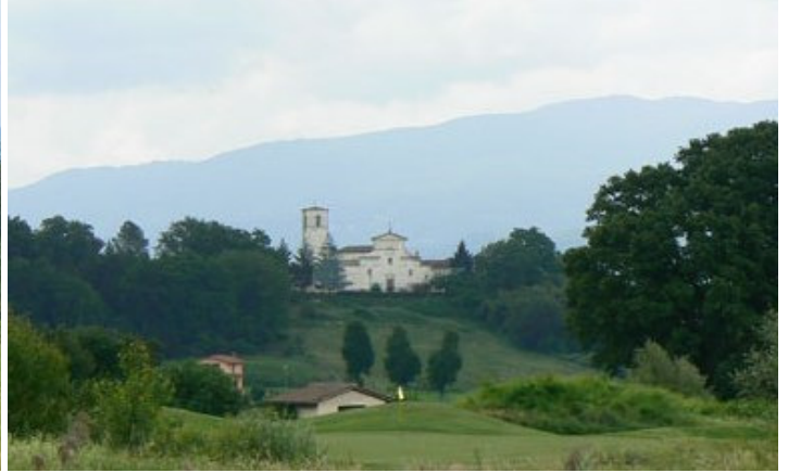
Surrounded by history

The non-golfers will spend the morning in village of Mugello, where the local crafts, fine delicacies and the Outlet Village offering the best Italian and international brands at exceptional prices are certain to make it a very special outing.