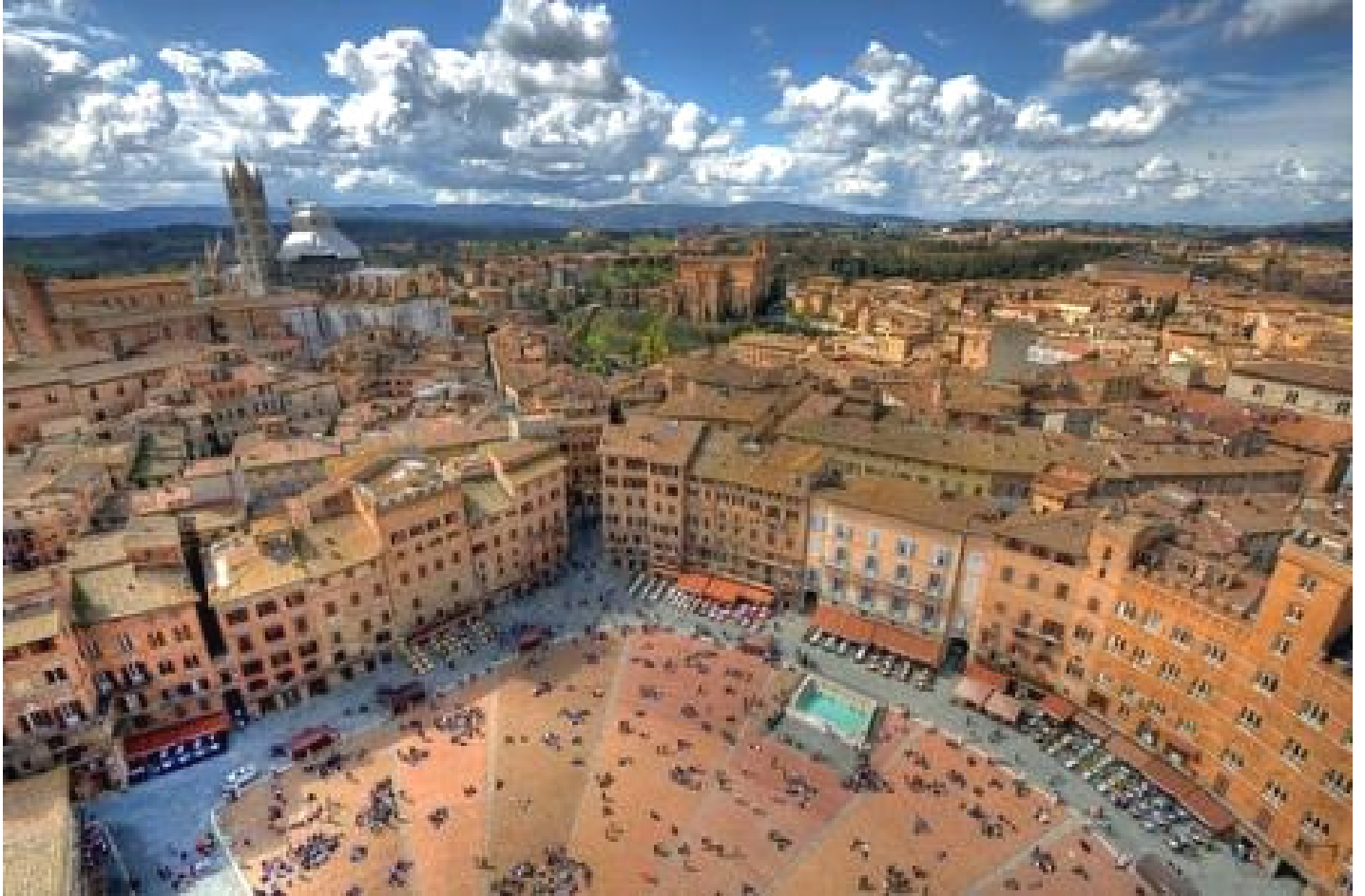
Aerial view of Siena's Piazza il Campo

Today is an early start as we head to the number one hill-top town of Tuscany... Siena . Brick palaces, stone towers and fabulously decorated churches are strung along the high ridges of Siena....offering Siena's half-moon Piazza is one of the loveliest in Italy and is home to the biannual Palio horse race and endless cafes serving the finest coffees. Siena's medieval town hall...Palazzo Pubblico...now a museum, is an incomparable example of the decorations and art of the early days of Tuscany.