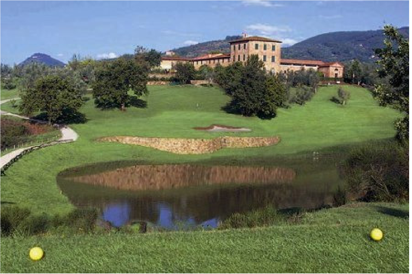
Perfect Tuscan setting from the tee

Our first round of golf in Italy is at Montecatini Golf Club , which winds through the natural contours of the Tuscan countryside. Good use was made of the landscape to create natural hazards...a very beautiful golfing setting which encompasses all the atmosphere of Tuscany.