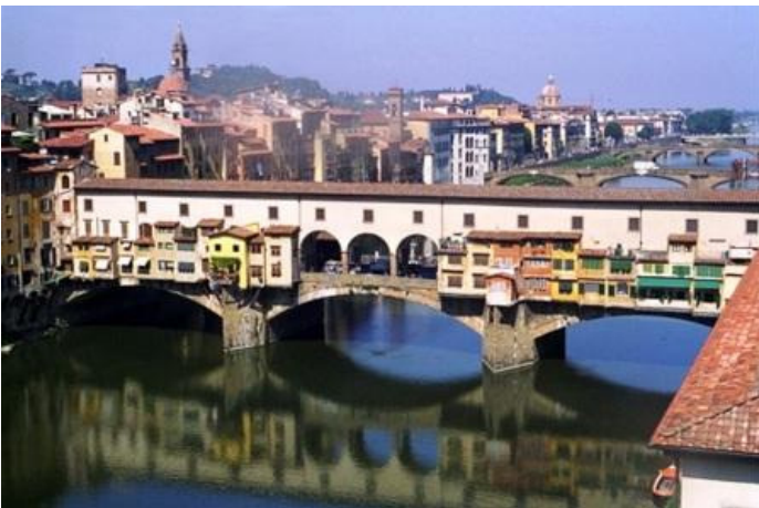
The bridges of Florence

Later, there is one last another opportunity to travel into Florence to experience more of this captivating city....whether it be sightseeing or shopping.