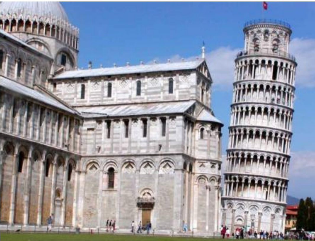
The Leaning Tower of Pisa

After breakfast we transfer to PISA , where we spend the morning exploring the Piazza del Miracoli (the Square of Miracles), widely regarded as one of the most gorgeous squares in Italy. Its most famous attraction is the iconic Leaning Tower , but visitors are equally awed by the Duomo and the Baptistry.