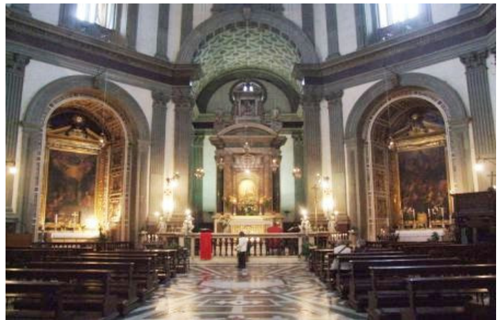
The impressive Duomo of Pistoia

Later, there is one last another opportunity to travel into Florence to experience more of this captivating city....whether it be sightseeing or shopping.