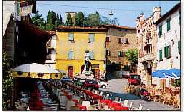
Al fresco dining Tuscan style