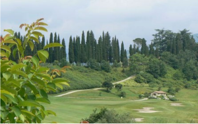
Poggio dei Medici GC

Today's golf is at the impressive Poggio dei Medici Golf Club , home to the Italian Women's Open for many years. Lying in the scenic Mugello Hills, it is a course with touches of link-style and parkland. The stream running through the course adds to the beauty (and challenge) and the lasting memory is one of memorable scenery and tranquillity.