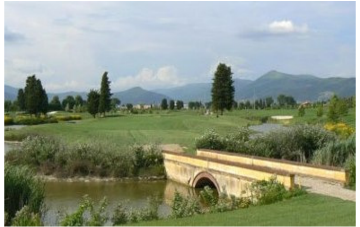
Tuscan bridges to the fairway

The nearby town of Pistoia is renowned for its street markets and its picturesque market square and will give the non-golfers one last chance to experience and enjoy the Italian experience.