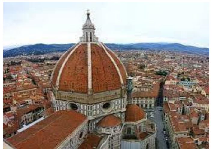
The Duomo of Florence