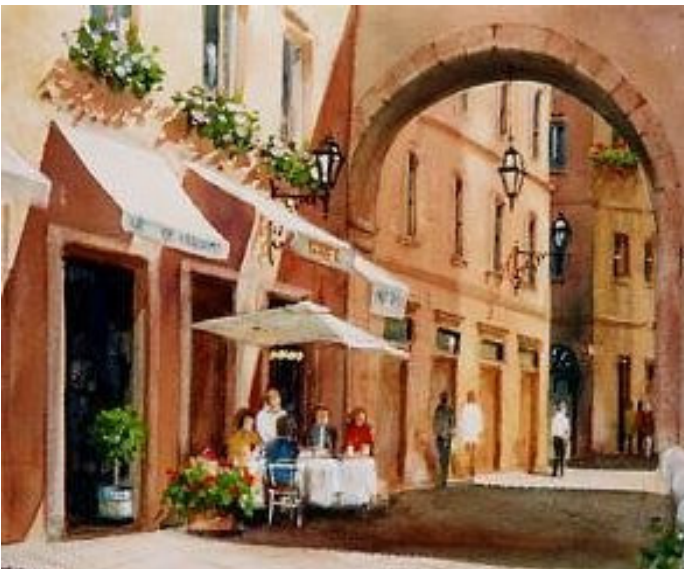
Coffee shops in every alley