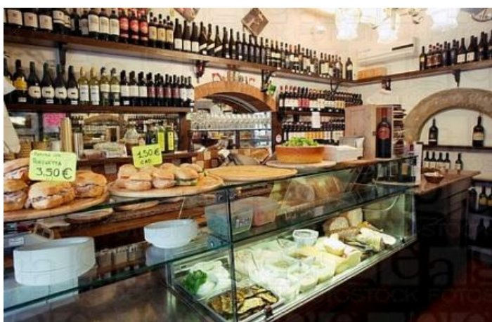
Shopping for wine and delicacies