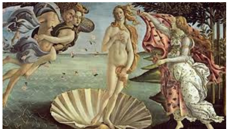
Boticelli's "Birth of Venus" at the UFFIZI