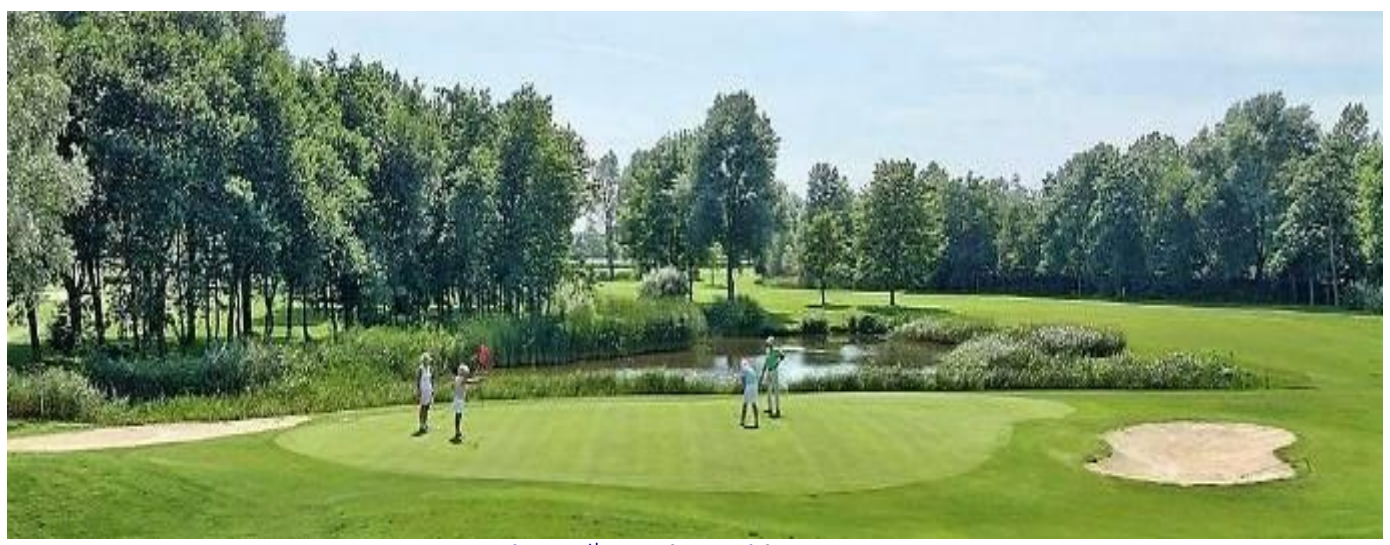
The 18th at Sluispolder GC