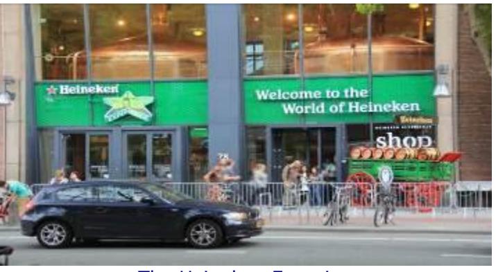
The Heineken Experience