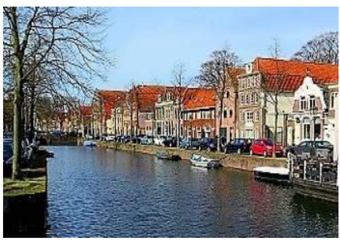
After settling in, a short orientation walk through picturesque Hoorn will invigorate the travel weary...and as the sun sets a drink and dinner in one of the many restaurants along the waterfront of Hoorn is a perfect way to start discovering the local brews, cheeses and cuisine!