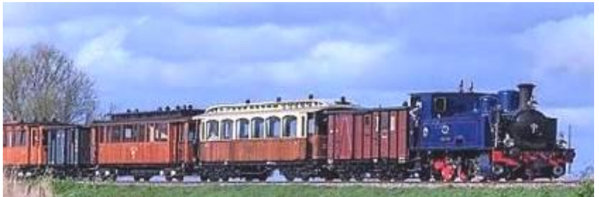
One of the most scenic railway journeys in the world