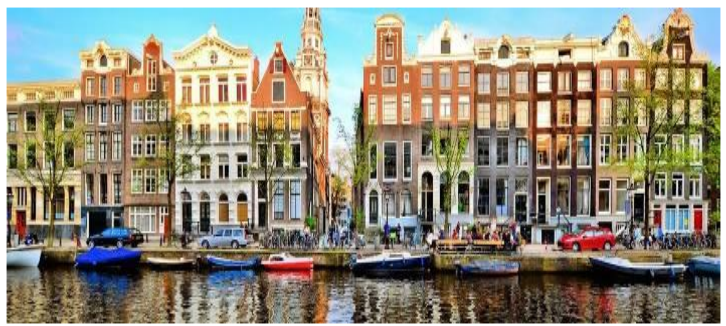
So much to see in Amsterdam