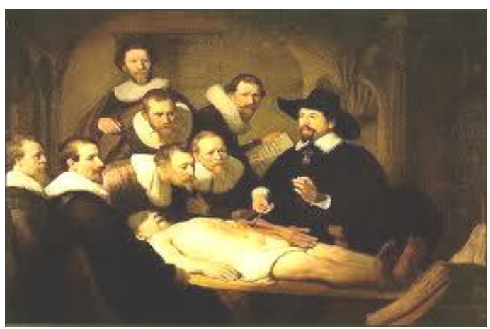
The very best of Rembrandt are in Amsterdam