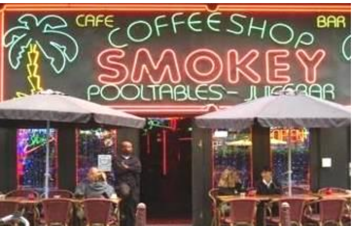
A really happy coffee shop