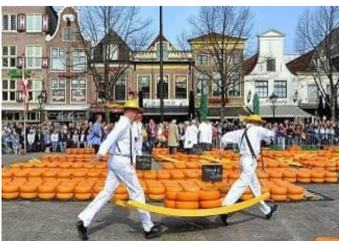
Alkmaar's famous cheese market and its industrious cheese-porters