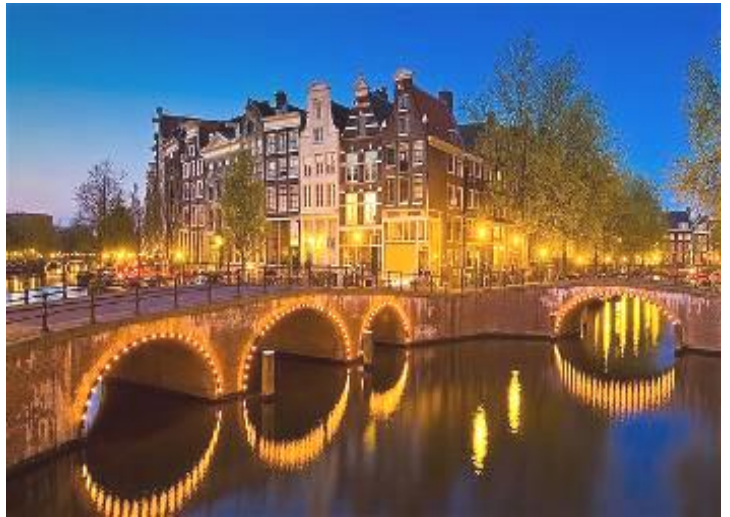
The canals by night