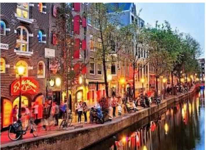
Vibrant Amsterdam nightlife