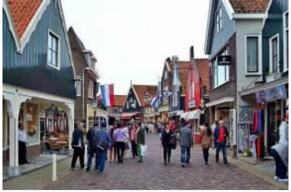
The main street of Volendam on the dyke

Next stop for the non-golfers is the colourful town of Volendam , which was built behind a dyke and like almost half of he country lies below sea level. The top of the dyke is today lined with varied shops, restaurants and a number of tourist attractions. With so many restaurants .... seafood and cheese take on a whole new meaning in Volendam.