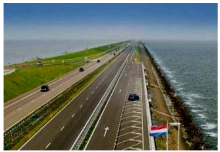
The 32Km man-made dyke with 4 lanes