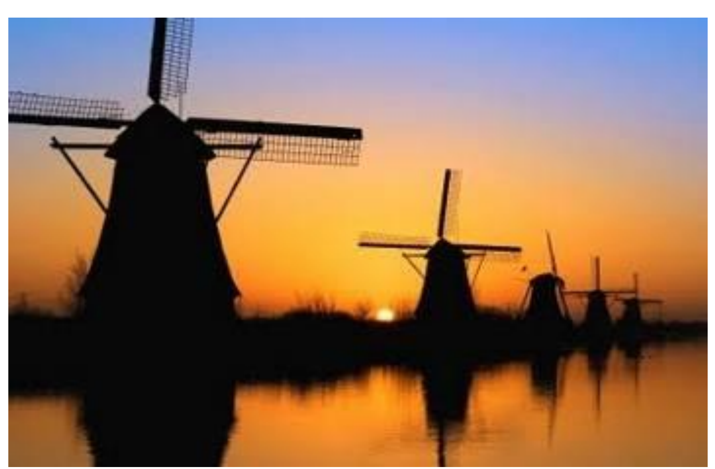
One last sunset.... Holland-style