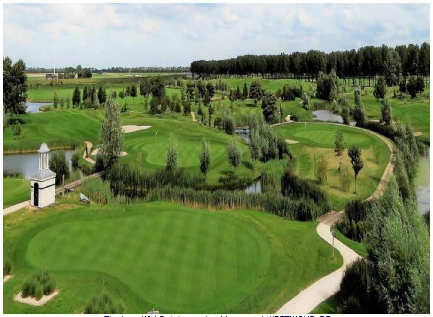
The beautiful Dutch countryside around WESTWOUD GC

This morning the golfers tackle WESTWOUD GC a beautiful parkland course with all the Dutch scenery on-hand, including the cows grazing beside some fairways. Westwoud is renowned for being the friendliest club in the region, with coffee and hot chocolate awaiting golfers on arrival.