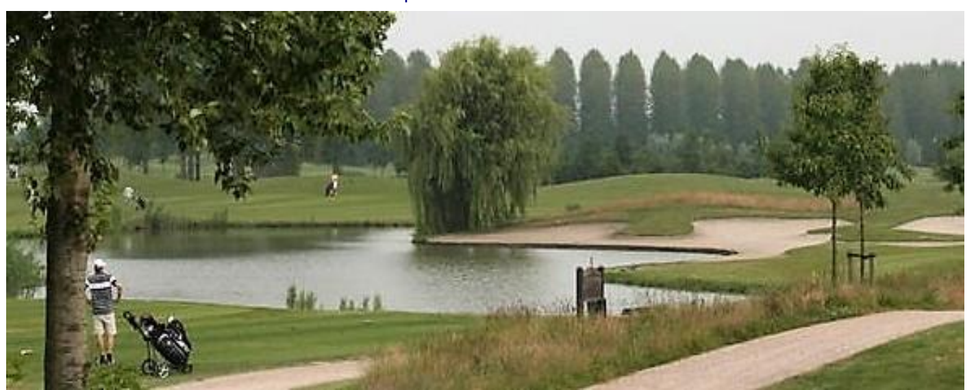
Parkland with plenty of water