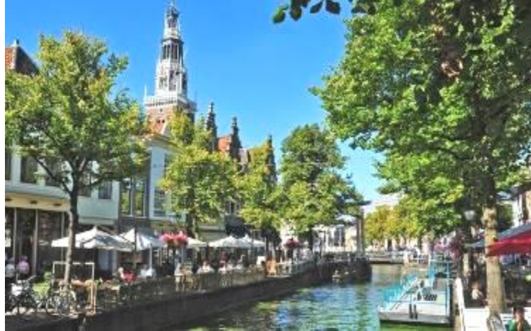
Pedestrian mall in Alkmaar