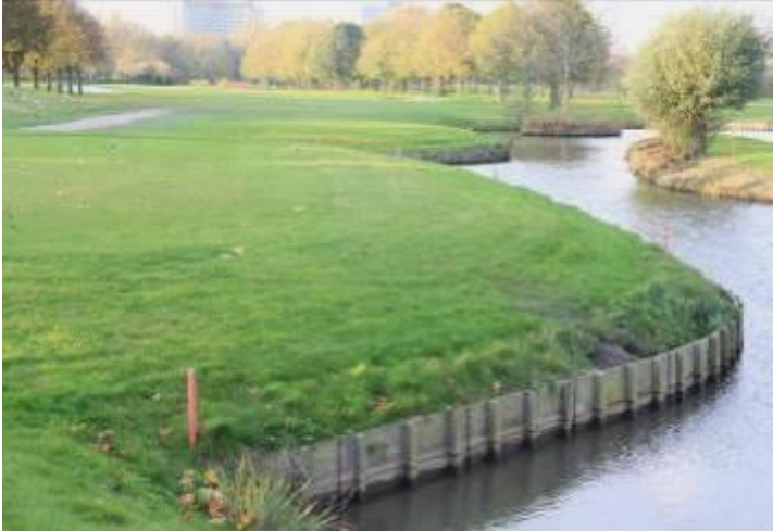
Golf in Holland is one of the hidden gems of world golf