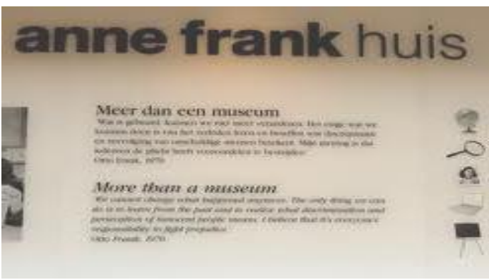
A memorable and sobering visit