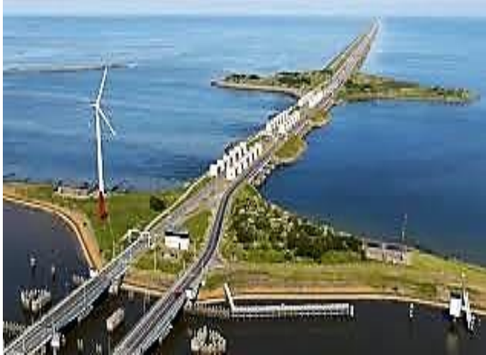
The Western On-ramp to the Afsluitdijk