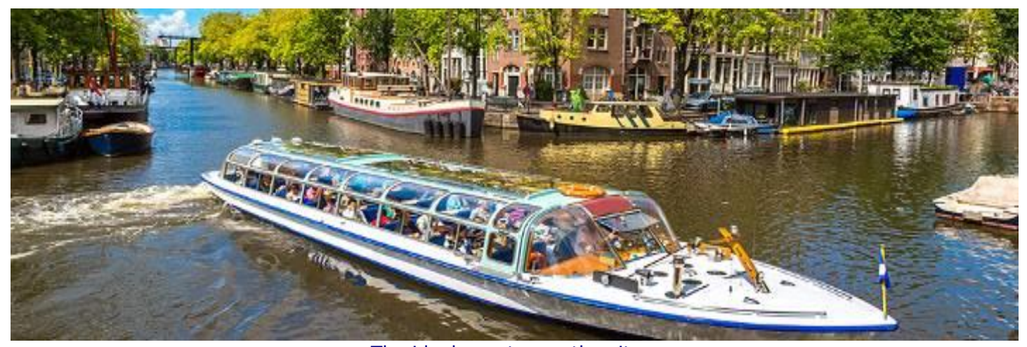
The ideal way to see the city