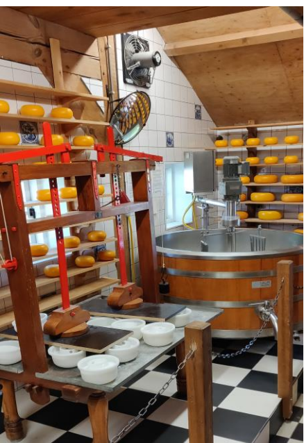
Zaanse Schans....A living Dutch museum...from its famous windmills to cheese making