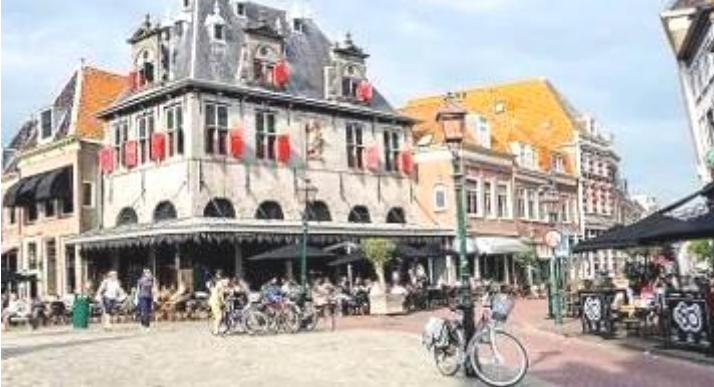
Relax, chill, enjoy......Hoorn awaits