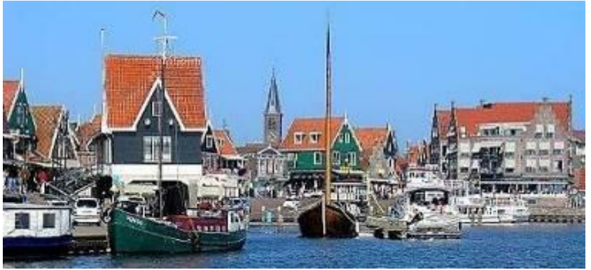
Volendam is built on a Markensee dyke