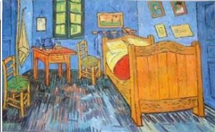
View Van Gogh's masterpieces