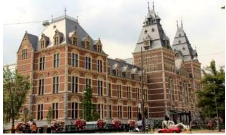
The world-renowned Rembrandt Museum