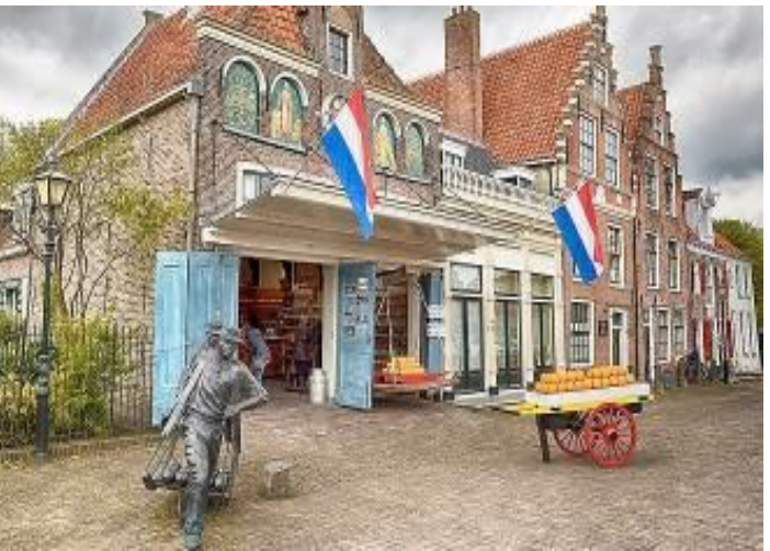
The famous cheese market of Edam