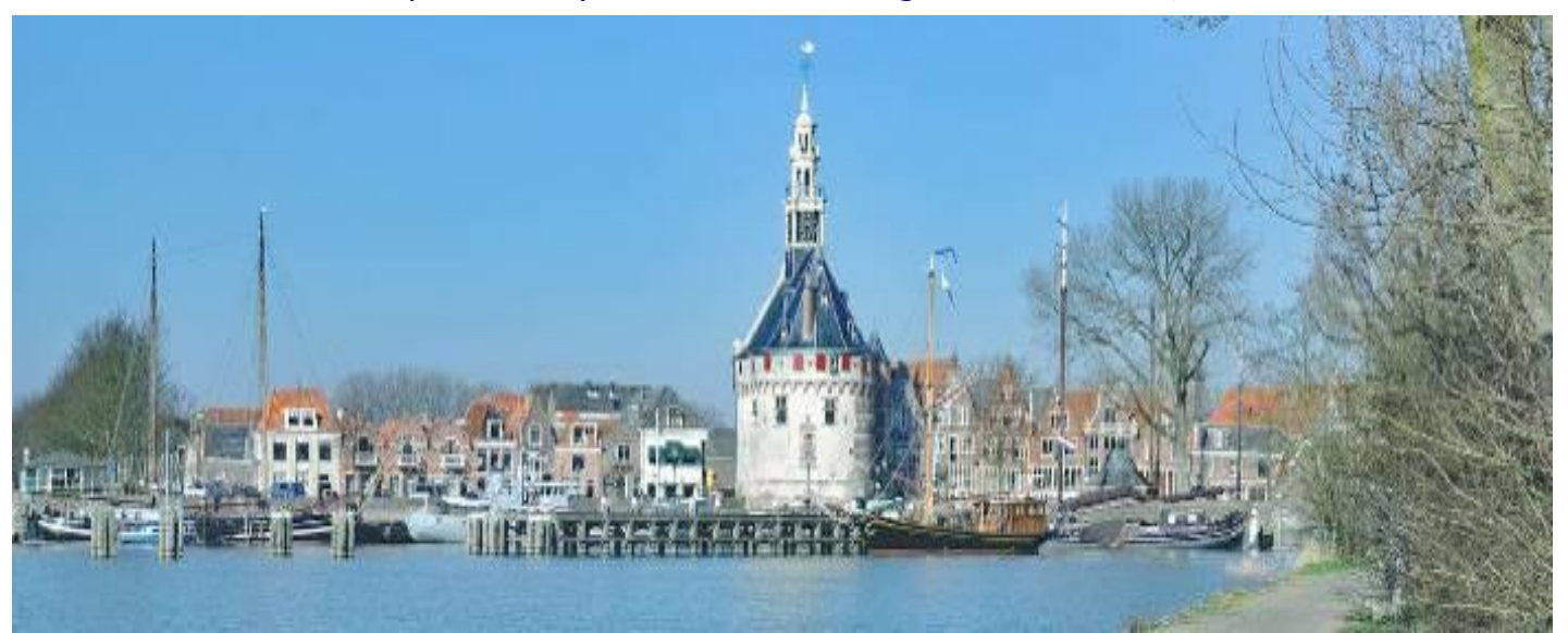
Hoorn has an amazing nautical history