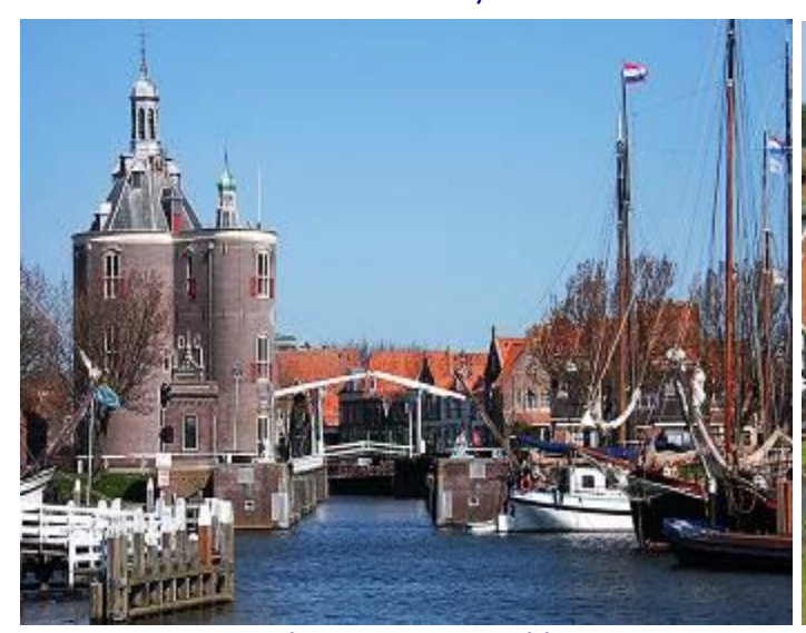
Historical entrance to Enkhuizen