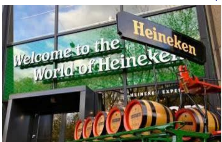
The legendary Heineken Experience