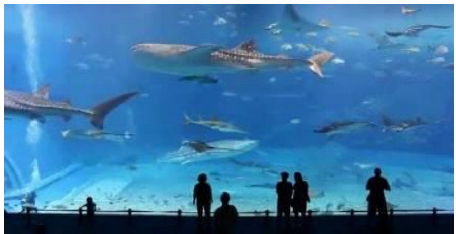
A breath-taking experience