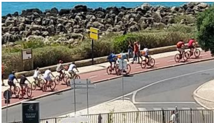
Heading off along the cycle path