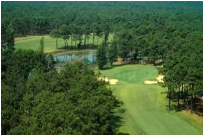
Winding through the forests