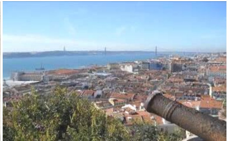
The endless view over the city from the Castle