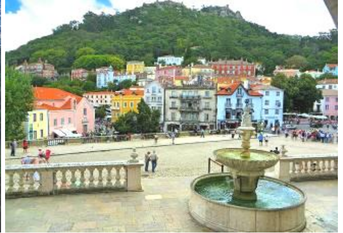
The Sintra Town Square