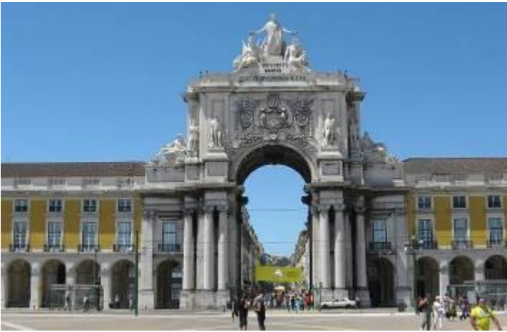
Triumphal Arch at the impressive Commercial Square