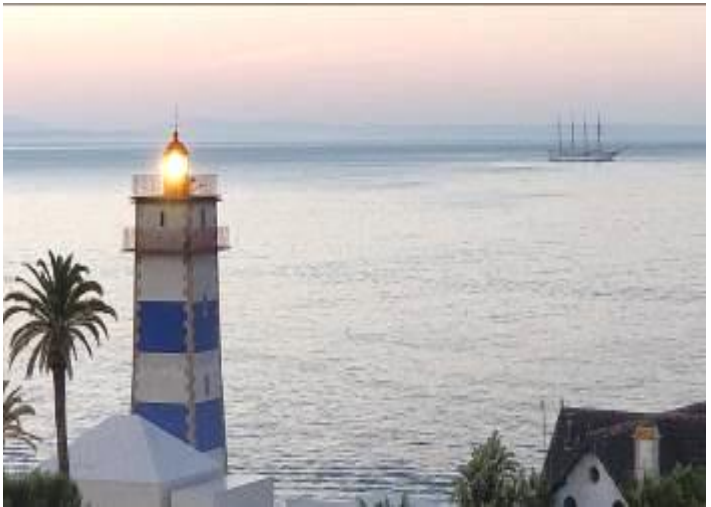
What a way to wake up each morning