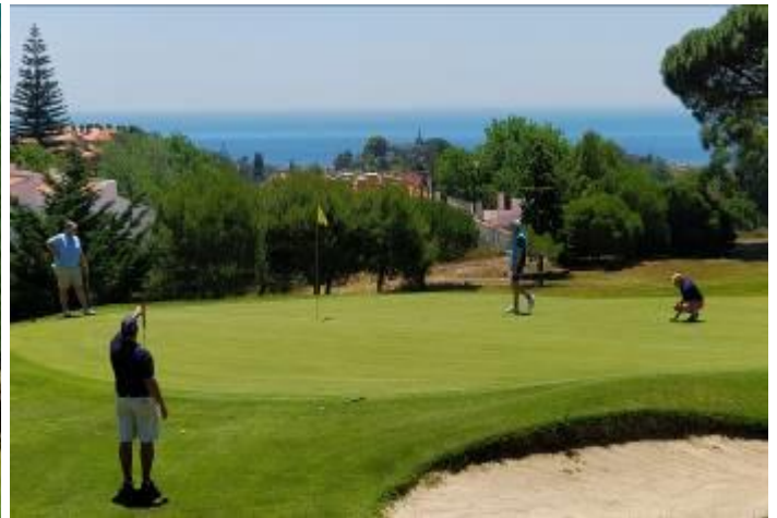
Sea views from the 18 th green