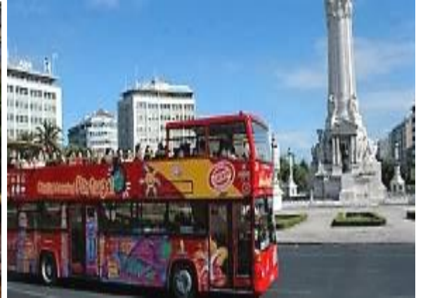
Tour the city on the Red Hop-On Hop-Off bus