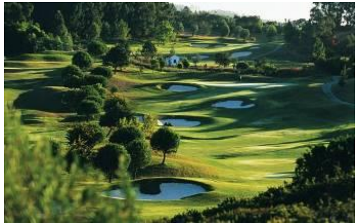
It does not get much better than this!!!

While the golfers are taking up the challenge of their first golf in Portugal, the non-golfers have the opportunity to explore the attractions and sights of Cascais...and get a taste of the laid-back lifestyle of the locals.