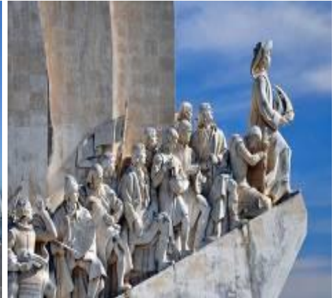
They discovered the Cape

After the chance to walkabout and photograph the monuments, we proceed to the Beer Museum on Commercial Square where we start our walkabout of Lisbon, including the Baixa which is filled with restaurants, cafes and shopping of all descriptions. Major attractions certain to be popular include the Castle, the relaxed squares surrounded by laid-back eateries, the varied and endless shopping, a tram ride to anywhere or no-where just to experience the sounds, a ride on a friendly tuk-tuk to take in all of the city's sights. A big day in a fascinating city.