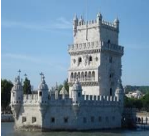
The Belem Tower

The Monument to the Discoveries lies on the northern bank of the Tagus River estuary, where ships departed to explore and trade with India and celebrates the Portuguese or Age of Exploration during the 15th and 16th centuries. The monument's connections to South Africa are enormous. The Belem Tower, built in the early 16th century, was part of a defence system at the mouth of the Tagus river and a ceremonial gateway to Lisbon. The tower's importance to the history of Lisbon is reflected in its Unesco World Heritage status.