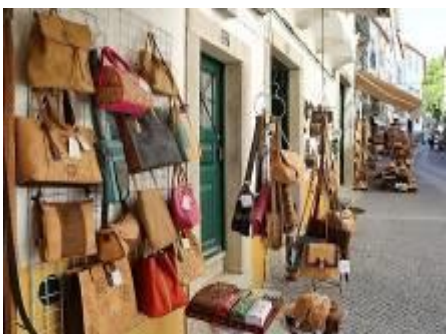
Portuguese leather and cork

While the golfers are taking up the challenge of their first golf in Portugal, the non-golfers have the opportunity to explore the attractions and sights of Cascais...and get a taste of the laid-back lifestyle of the locals.