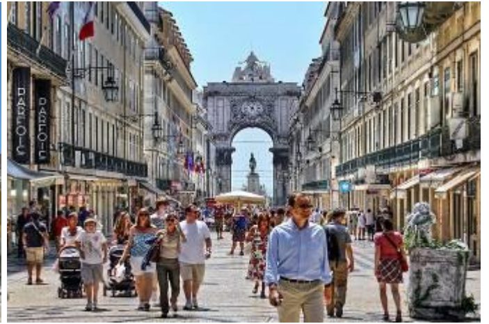
Strolling, shopping and eating in the BAIXA