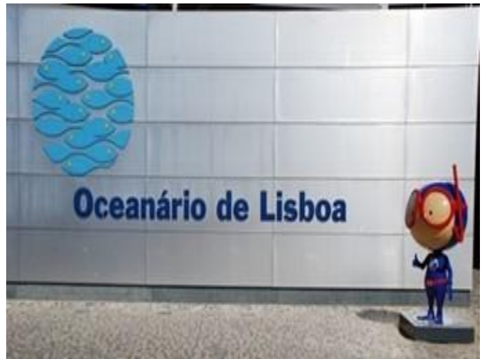
The world's #3 Oceanarium