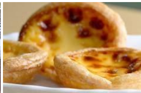
Portuguese Custard Tarts