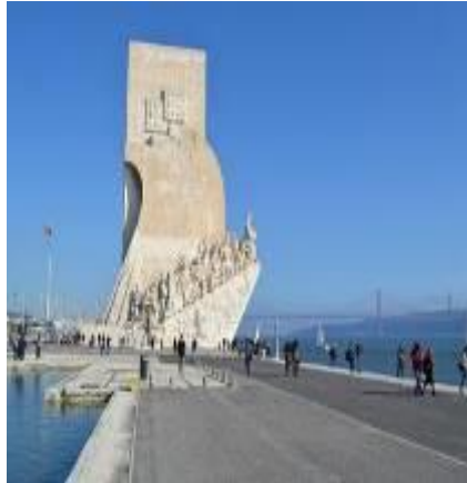
Monument to the Discoveries