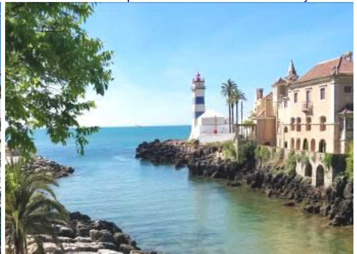
Cascais' famous lighthouse inlet