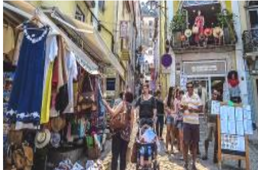
Strolling, browsing and ice-cream