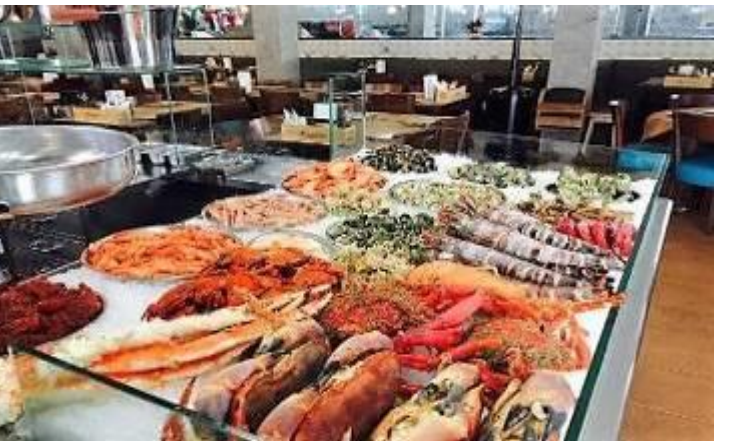
Portuguese seafood restaurants everywhere