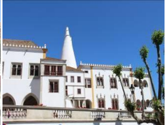
The Sintra palace with its distinctive chimneys