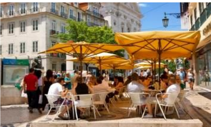
Lunch, beers, a glass of wine..... a stop at one the BAIXA al fresco restaurants is a must