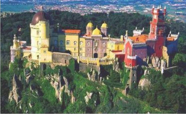
The magic of Sintra

After a guided tour of Sintra, including entrance to Pena National Palace, there is time for lunch at one of the restaurants or bars in the centre of Sintra and a walk about in the tourist shopping area before heading back to Cascais.