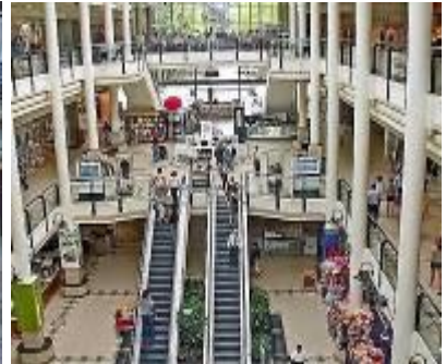
...and there's a Mall