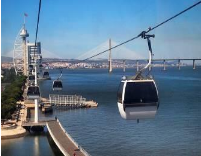
Great views from the cable cars at the Oceanarium

A big attraction in Lisbon is always the Lisbon Oceanarium, which is currently rated the best oceanarium in the world by Trip Advisor. And a great way to spend the day is to catch the coastal train into Lisbon, ride the cable cars along the coast, visit the Oceanarium, have lunch in Baixa or Alfama and be back in Cascais for sundowners.