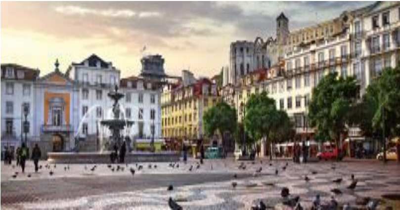
Picturesque squares of Lisbon