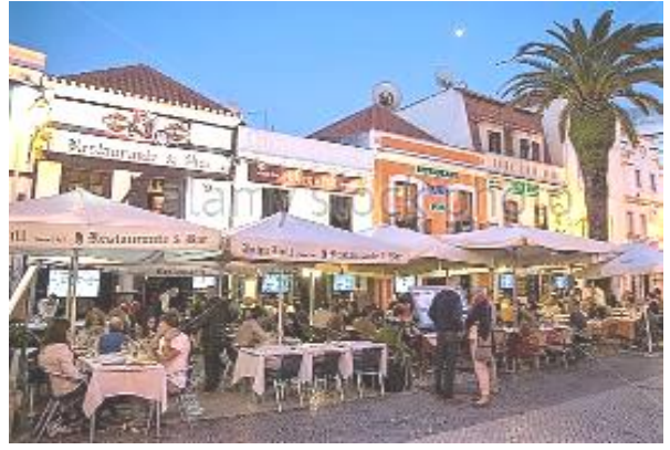
Dinner in Cascais