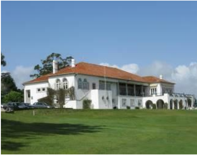
Estoril's stately clubhouse

Our second round of golf in Portugal is at the impressive and stately ESTORIL Golf Club, home to many local and regional tournaments and regular host to the Portuguese Seniors Tournament. Winding through the indigenous forests of the region, Estoril GC is a perfect example of Portuguese golf and boasts one of the friendliest clubhouses in Portugal. Ian Fleming, the creator of James Bond, is probably the club's most famous member ever and wrote Dr No on the clubhouse balcony.