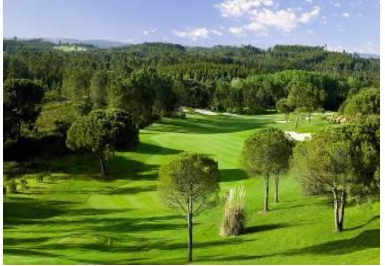
Typical Portuguese fairways