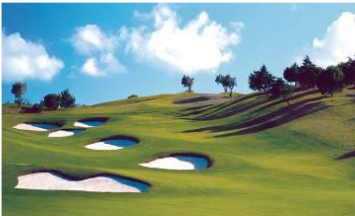
A European Top 30 golf resort...for sure