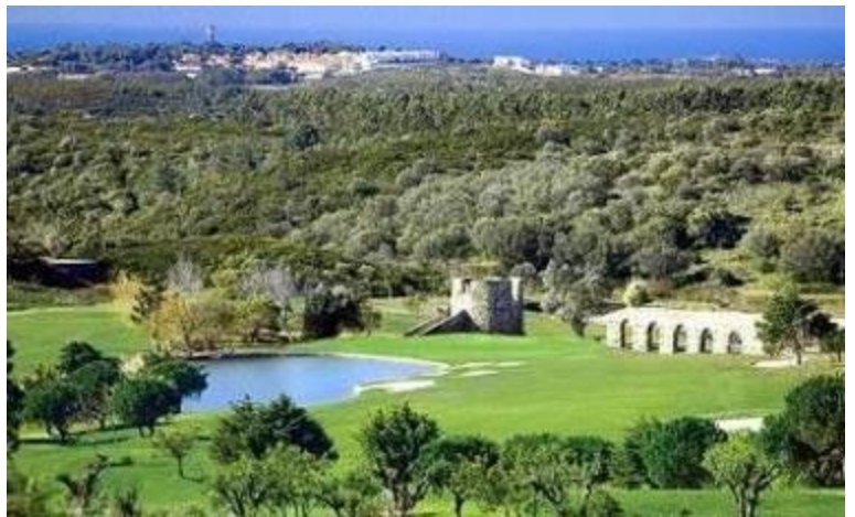
Ocean views, forests and an ancient aqueduct