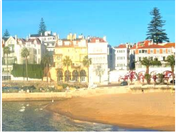
Safe, protected swimming beaches