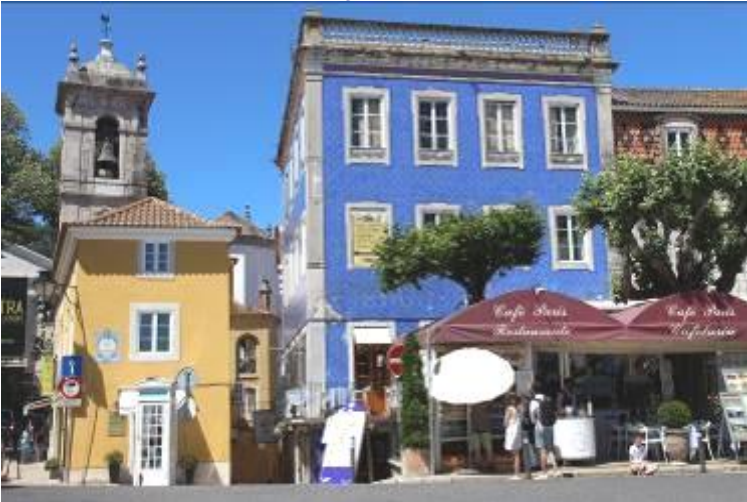
Colourful cafes, bars and restaurants