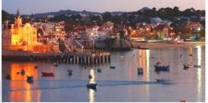
Sunset in Cascais