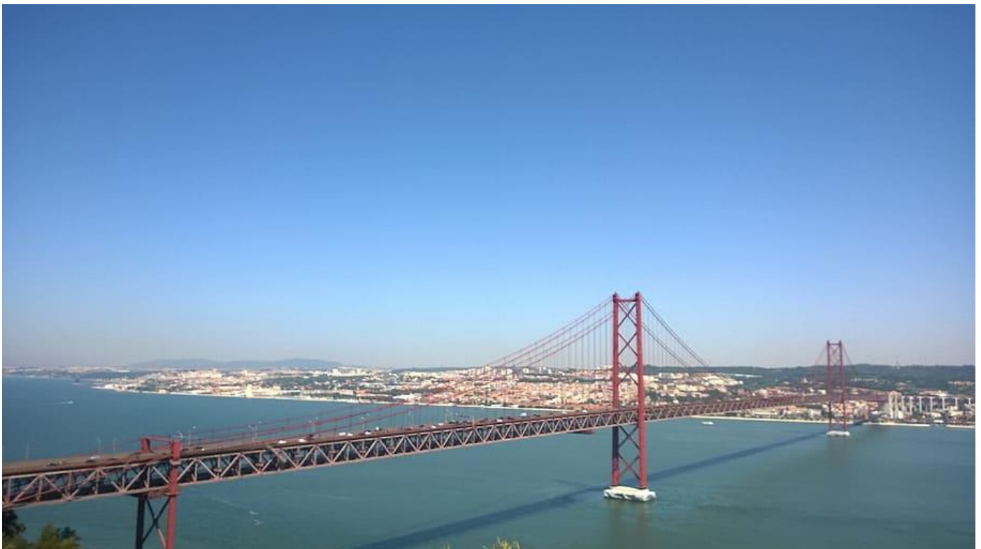
The 25 April Bridge over the Targus River

A special addition to our Cascais tours is a crossing of the 25 April Bridge across the Targus River to get a spectacular view of the city of Lisbon and the surrounding region.