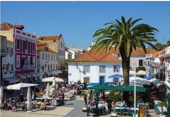
Dinner on the square in Cascais