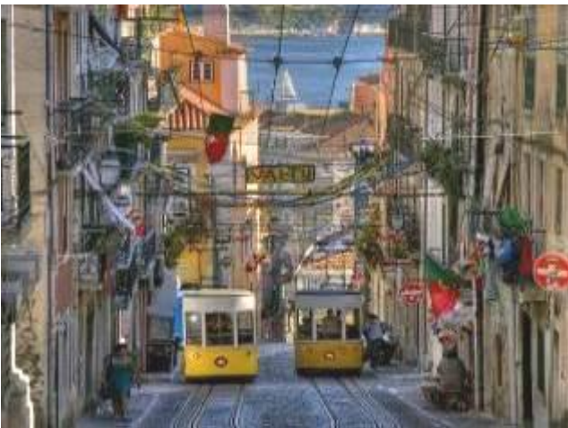
Lisbon's famous trams