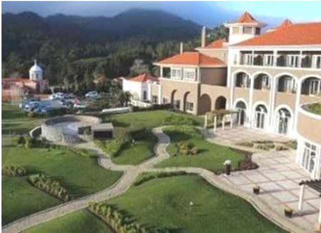
The magnificent clubhouse and Pro Shop

Our first scheduled round of golf in Portugal is at the legendary PENHA LONGA Golf Club, a European Top 30 golf course and a golfing experience never to be forgotten. Part of the Penha Longa Resort...ranked #11 of European Resorts, the course winds through and over the surrounding hills and through the mixed forests of the region. A fitting start to a wonderful golfing experience.