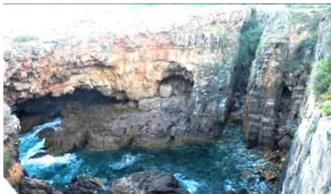
The famous "Inferno Caves"