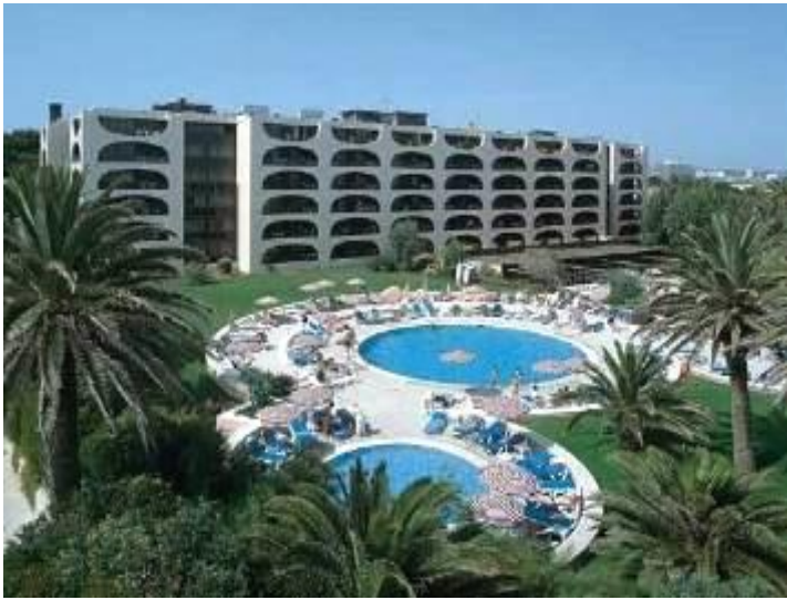
Our hotel in Cascais

On assembling at Lisbon Airport, we transfer by air-conditioned coach to our hotel in Cascais, which lies 25km West of Lisbon. Our 2024 group will again stay in the immensely popular 4-star seafront Vila Gale Hotel, with a choice of sea-view or land-view rooms. Cascais is a seaside town known as a holiday-mecca by those who have enjoyed its relaxed Portuguese ambience. Filled with restaurants, shops, local markets, beautiful beaches and lying on a coastline of postcard beauty, Cascais is just a short local train ride from the centre of Lisbon. Numerous restaurants line the coastline, and the casino resort of Estoril is the neighbouring suburb.