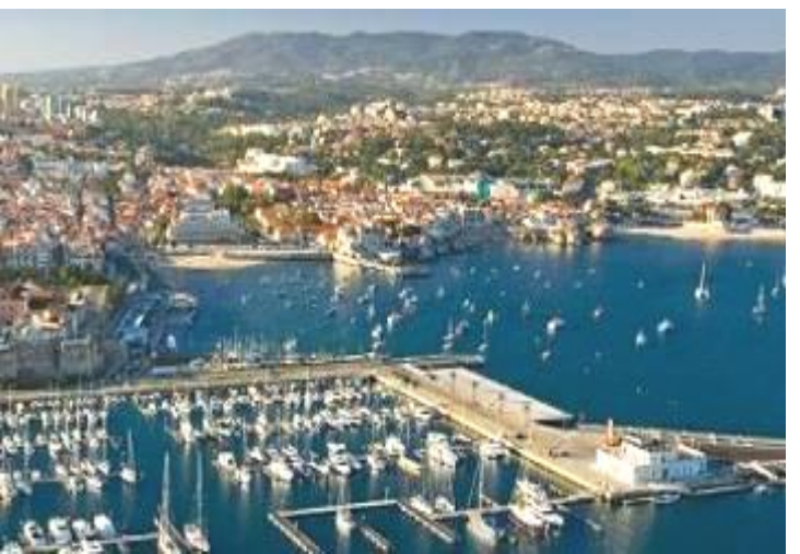
A buzzing coastal town